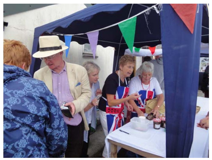
Business is Brisk