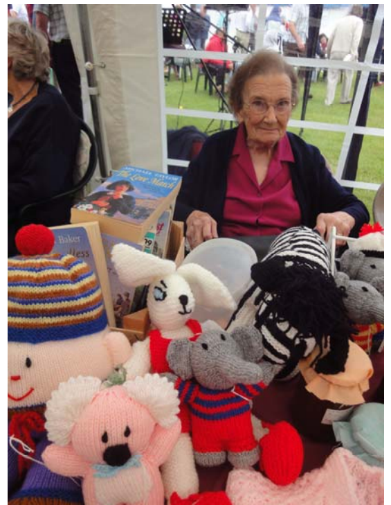
Lovely produce from Dyliss