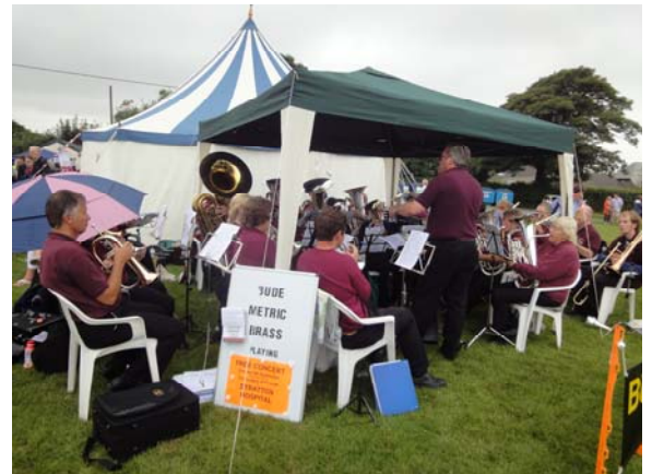
The Band played on