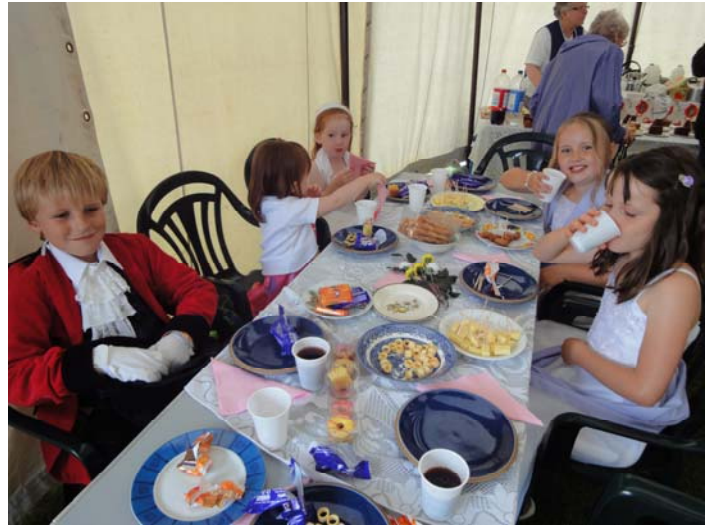
Time for Tea