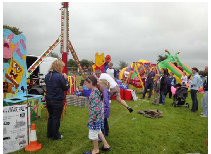
All the fun of the Fair