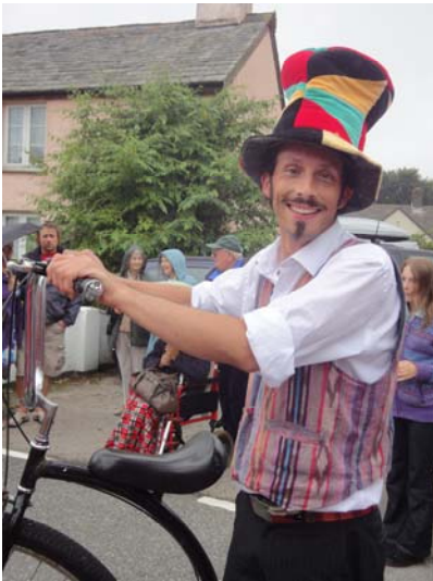
That Looks Good!!