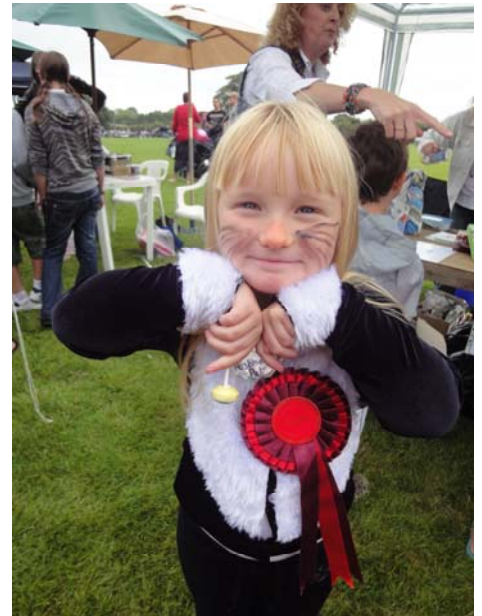
Cool Cat Rosie