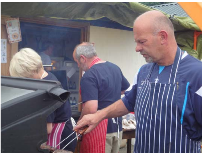
Bring on the Burgers